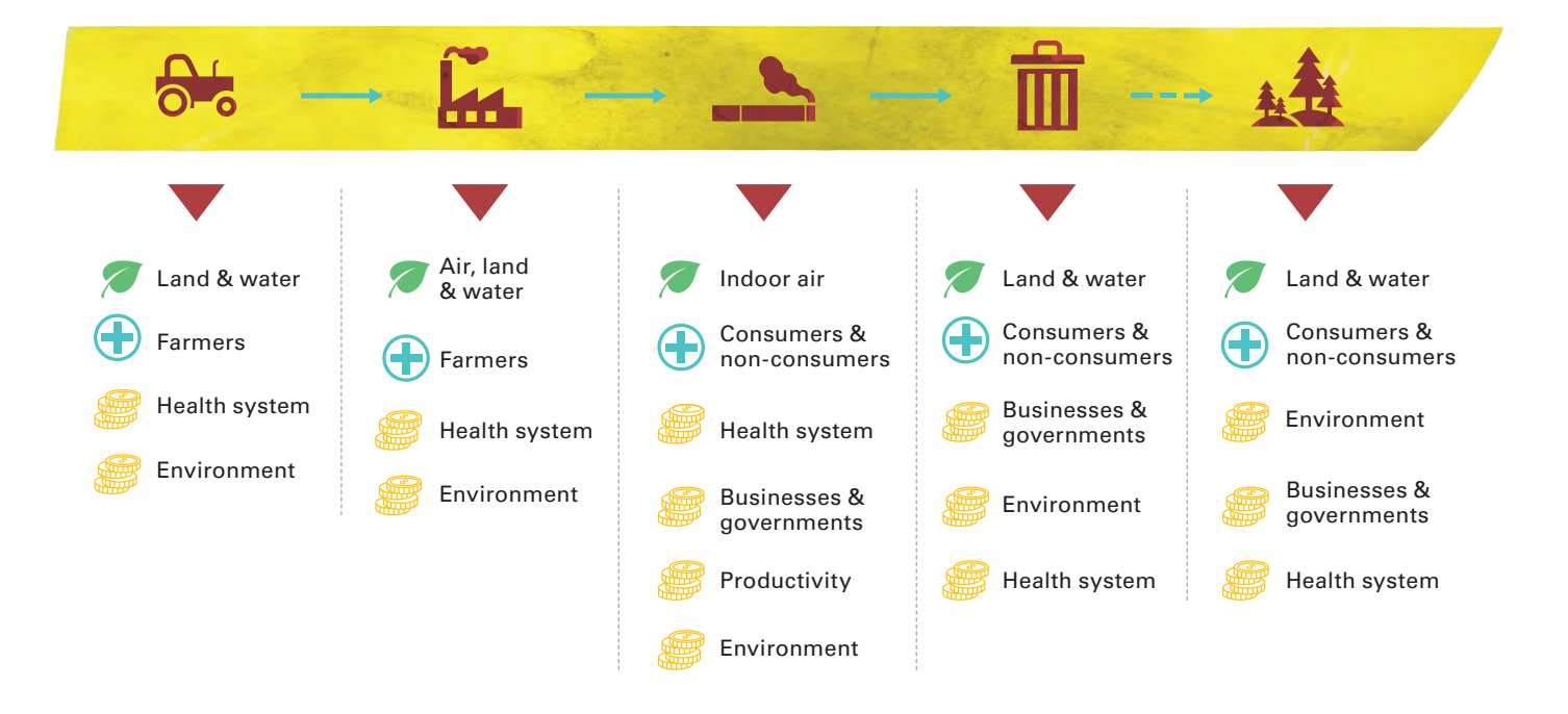
FIG 1. IMPACT OF TOBACCO LIFE CYCLE ON HEALTH, ENVIRONMENT AND ECONOMICS

Fig. 1 summarizes the impact of each of the five stages of the tobacco production and consumption life cycle (farming/cultivation, production, consumption, disposal and "residual" tobacco waste that remains in the environment) on our health, environments and economies. The figure illustrates how every stage of the tobacco life cycle impacts several different factors, contributing to long-lasting and persistent adverse effects (1–4).